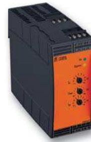
Softstarter UH 9018

The softstarter UH 9018 is suitable for challenging applications requiring reduced torque during start-up and run-down. The device ensures that the drive can start up smoothly. This precludes the drive elements from being damaged, because no abrupt starting torque occurs when the device is switched on directly. After a successful start-up, the power semiconductor is bridged using internal relay contacts in order to minimize loss within the device. The soft start function is designed to extend the natural run-down time of the drive, also preventing an abrupt stop.